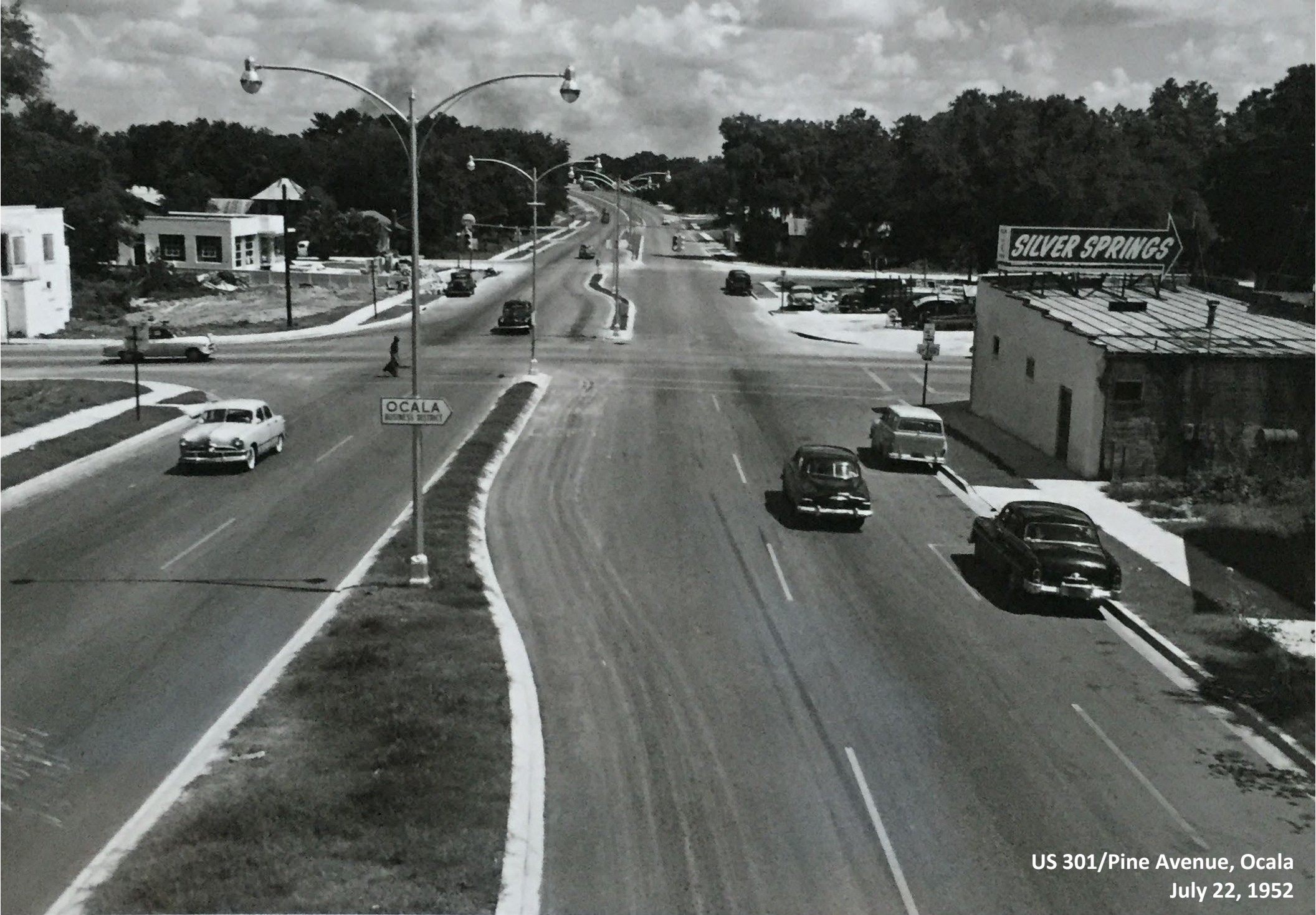
US 301/Pine Avenue, Ocala July 22, 1952