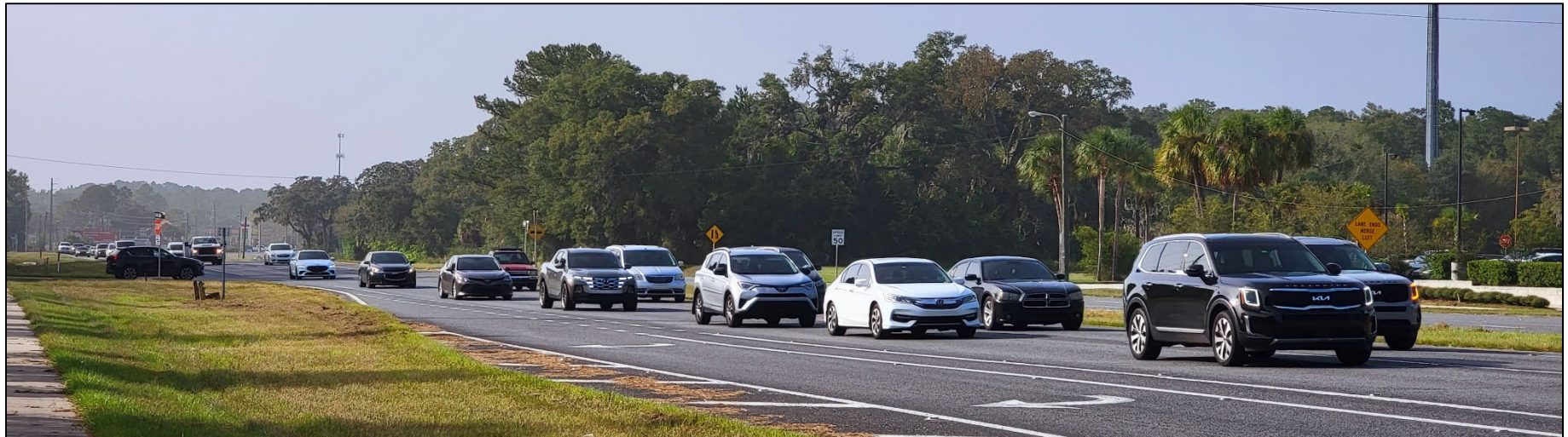
(Top) CR 316 bridge over I-75, (Bottom) SE Maricamp Rd (SR 464) at SE 36 th Ave